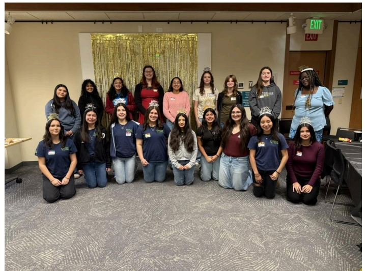
The TTAG Student Board, TTAG members & guest speakers