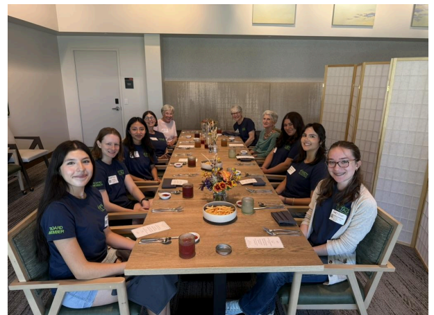
TTAG Student Board, Advisors and Sponsors at the Appreciation Luncheon, June 2025

With appreciation, The TTAG Student Board, TTAG Members and TTAG Advisors