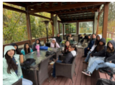
Lunch at SCWR after the tour