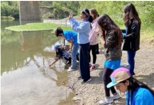
Tech Trekkers water testing with Sonoma Water Agency Education Center on the Russian River.