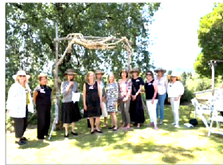
New Board of Directors