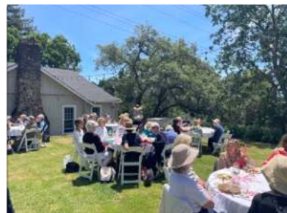
Members enjoyed lunch on the lawn