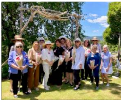
Thanking the Current Board

Our annual Spring meeting was greeted with another day of beautiful weather at the Healdsburg Golf Club at Tayman Park. Sixty enthusiastic members came together to celebrate our accomplishments for the year as well recognize the changes moving forward. This year, there were tables inside to highlight and sign-up for volunteer activities.