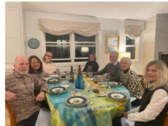
Cindy Power's home