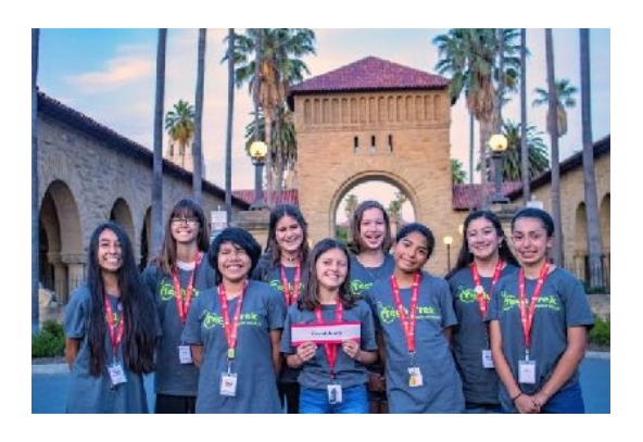
AAUW Membership Meeting October 14, 7-8:30pm High School Library

Come meet the girls AAUW Healdsburg sent to Tech Trek. These Tech Trekkers spent the week of July 9 at Camp Curie at Stanford University. This fantastic STEM program offered classes on robotics, cyber security, animation, forensics and money management. The parents often say that their child went to camp a "little girl" and returned a confident, self-assured girl.