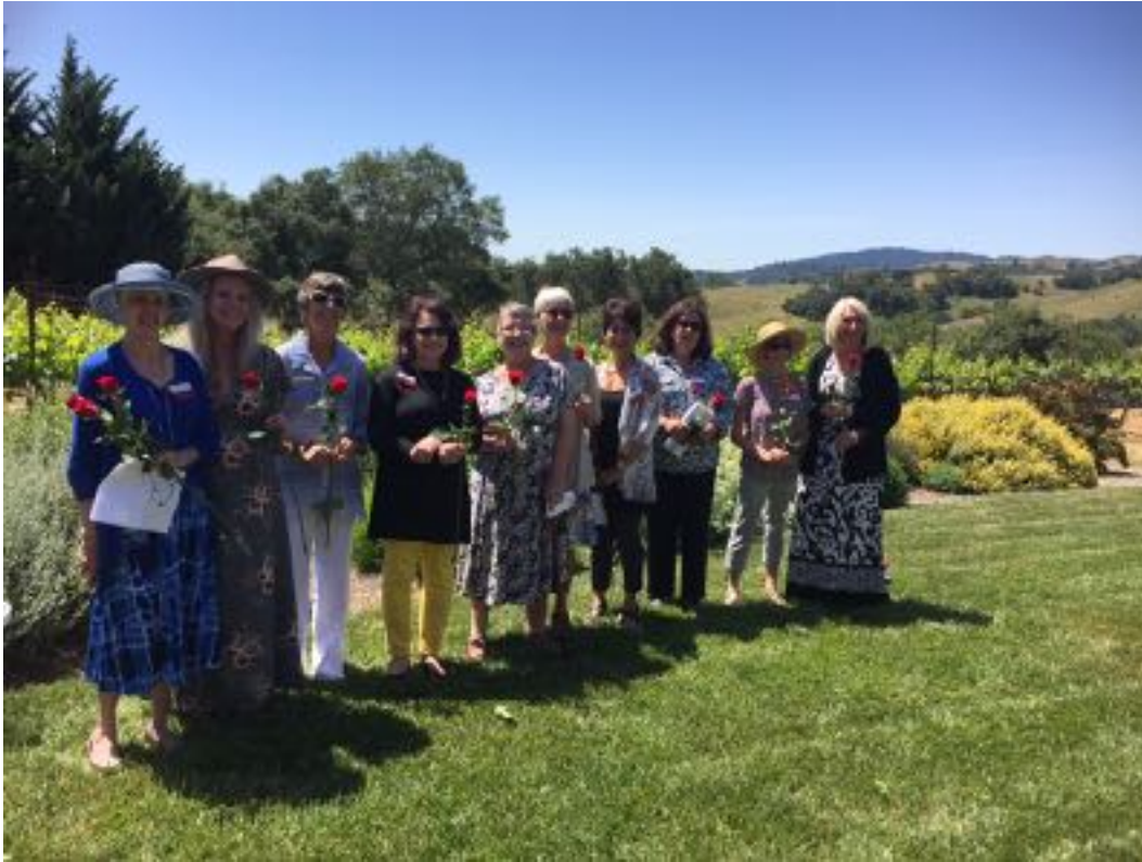
2018-2019 Healdsburg AAUW Board Members ( at the Installation Luncheon in May 2018)