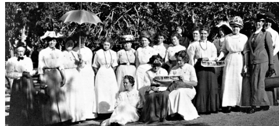
HEALDSBURG SUFFRAGISTS - c1911