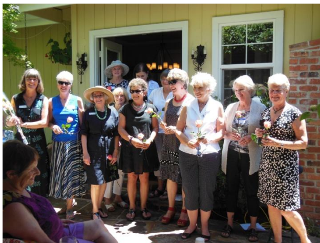
The new board for 2013-2014