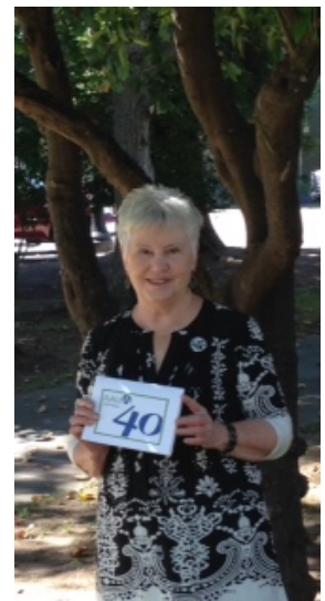
Coming of Age....