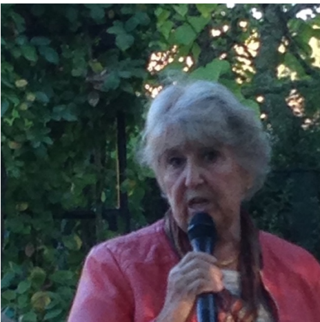
In the beginning....