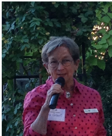
Towards the Millennium....