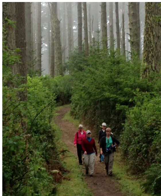
The hiking group at Point Reyes