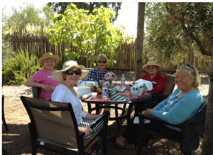
September's Truett-Hurst Winery Lunch Bunch Picnic