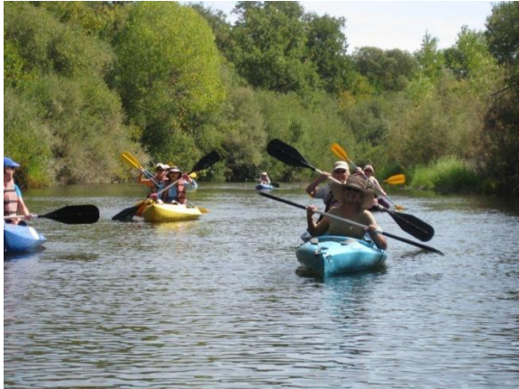
Kayaking down the river on a Thursday afternoon....