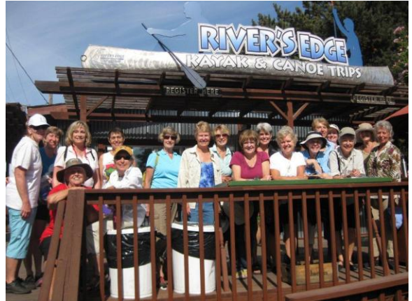
The intrepid kayakers!