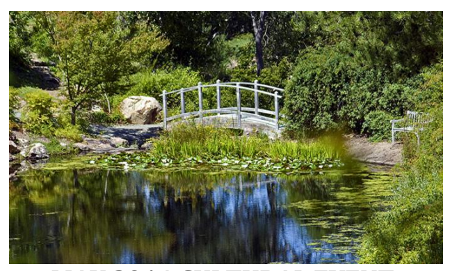
MAY 2014 CULTURAL EVENT: QUARRYHILL BOTANICAL GARDEN, Glen Ellen Wednesday, May 21

AAUW'S last Cultural Event of the year will be an excursion to Quarryhill Botanical Garden in Glen Ellen on Wednesday, May 21. Quarryhill is home to one of the largest collections of scientifically documented, wild-source Asian plants in North America and Europe, many of which represent horticultural favorites ancestors of found throughout the western world. Planting new seedlings occurs every spring and fall, thanks to seed gathered on more than twenty autumn expeditions to East Asia. Oaks, maples, magnolias, dogwoods, lilies, and roses are particularly wellrepresented in the garden, and increased efforts