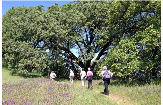
Thirteen-mile hike at Jack London State Park