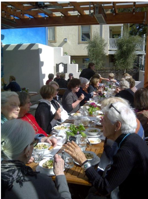
Friday Lunch Group at Taverna Sofia