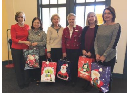
Healdsburg Elementary School